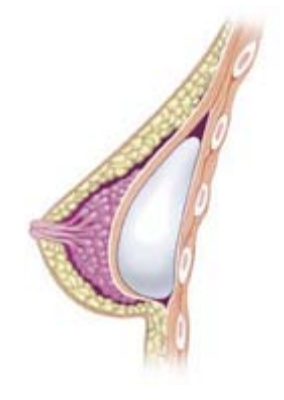
Breast after submuscular augmentation