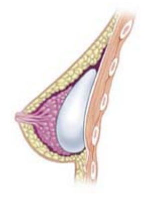
Breast after subglandular augmentation